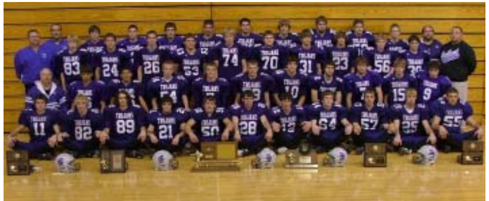
The Trojan football team takes on final picture with their trophies. The Trojans finished their season 13-1 and won their first state football championship in school history.