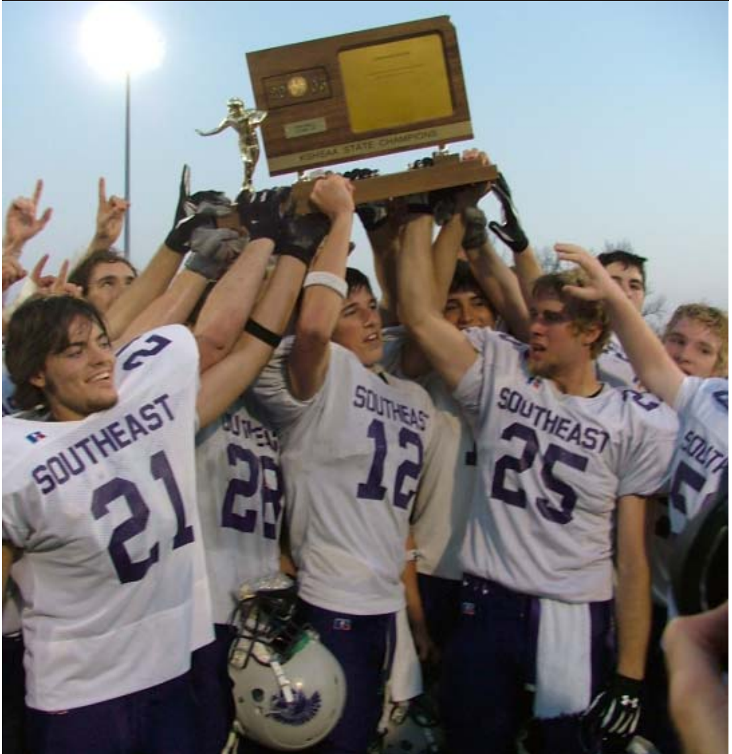
The Southeast of Saline State Champion football team celebrates after winning the 3A State Championship by hoisting their trophy in the air. The Trojans won over the Silver Lake Eagles 30-28. For more football pictures, see pgs. 6-7.

Dec 21, 2005 Southeast of Saline, 5056 E. K-4 Highway, Gypsum KS 67448, Vol. XXXI, No. 4 See The Trojournal on-line and in color at http://www.usd306.k12.ks.us