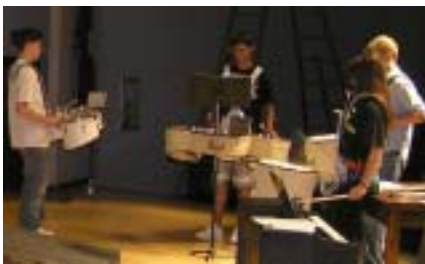
Drumline rehearses cadences in theater. They are preparing for K-State Band day.