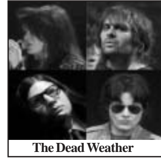
The Dead Weather

experimental, maybe, but definitely not amateur. The band could probably be called a super group. It brings together Jack White